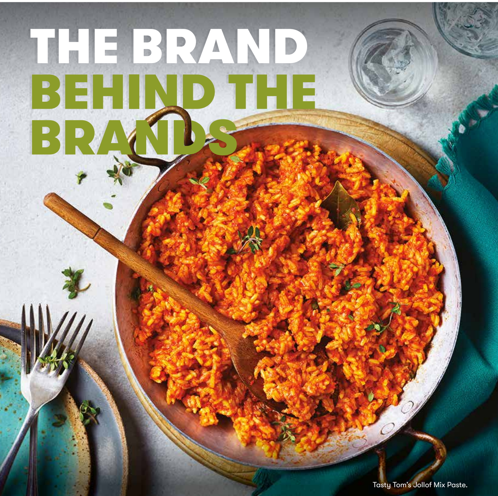
Tasty Tom's Jollof Mix Paste.