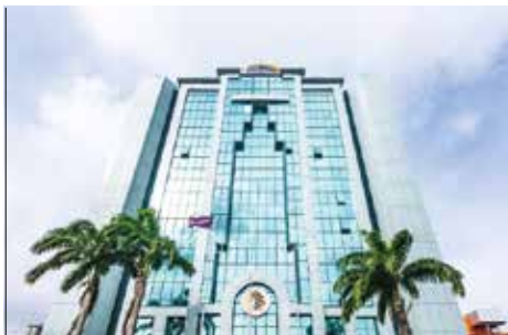
The headquarters of Africa Re in Victoria Island, Lagos.

The Corporation conducts regular training and provides targeted technical assistance to industry stakeholders for relevant capacity building. This was recently complemented by the Young Insurance Professional Programme that