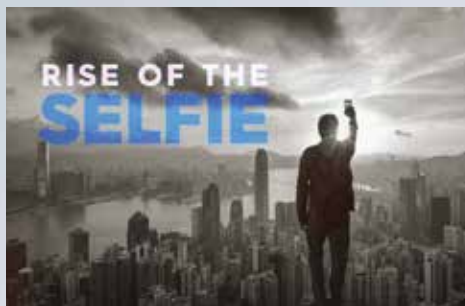
TECNO branded film The Rise of The Selfie on YouTube

Globally, TECNO is undoubtedly a dark horse that is championing the African market while gaining significant momentum and robust growth world-wide. So what makes TECNO a brand most admired by Africa? In a world driven by the rise of social media and young users, what is TECNO's strategy to hold on to and strengthen its leadership among future users? And what can we expect from the brand?