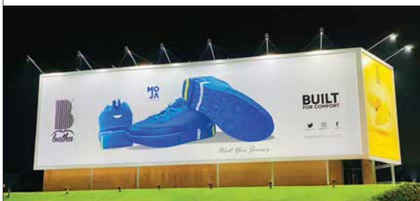
Above: South Africa's Bathu brand is taking Africa by storm, entering the Most Admired African Brands table at #10.

ing private sector brand at #2, in a private sector list where all multinational mobile operators in Africa – Vodafone Group (#3), Orange (#4), Airtel (#6) – and media brands Facebook (#10) and DSTV (#24) made the list of the Top 25. Unsurprisingly, the leading pharmaceutical groups, Johnson & Johnson (#12) and AstraZeneca (#25) feature, but Nigeria's Dangote (#8) is the only industrial brand in the list.